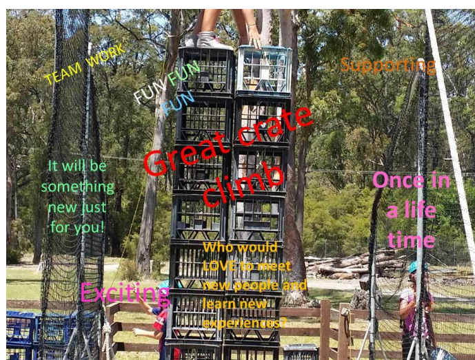
Crate Climb by Chloe