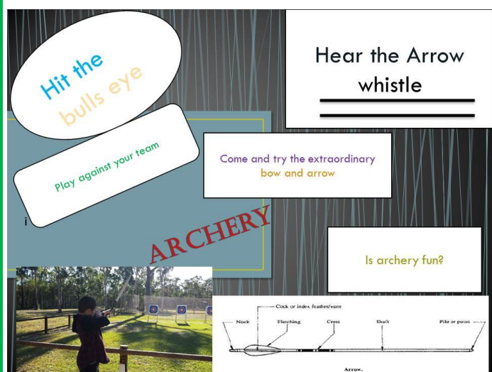
Archery by Tyson

The following four slides are the ones that I received from the students after completing their work and emailing it to me.