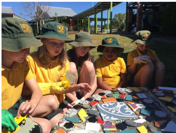
Sneak preview of our mosaic work.

A big thank you to all families and community members who have returned their RSVP slip for our LOLA launch on